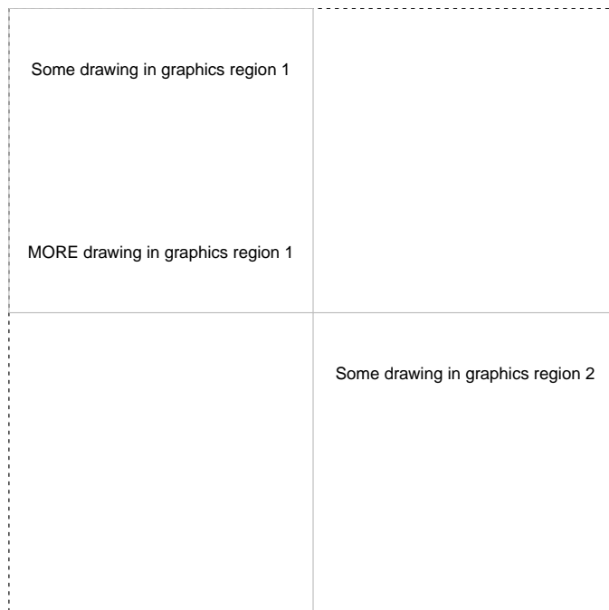
Figure 2: Defining and drawing in multiple graphics regions.